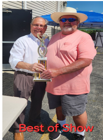
Best of Show